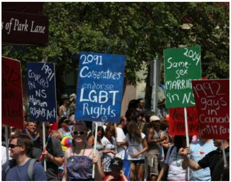
NSRAP in the Halifax Pride parade –history and future of change.

In addition to continuing our work related to LGBTQ elders and organizing our annual activities, NSRAP will continue to collaborate with members of the community and partner with other organizations in order to further our goals. This will hopefully include strengthening our relationship with Egale Canada and with government departments and officials as we continue to seek legal reform. In addition, fund development will remain an