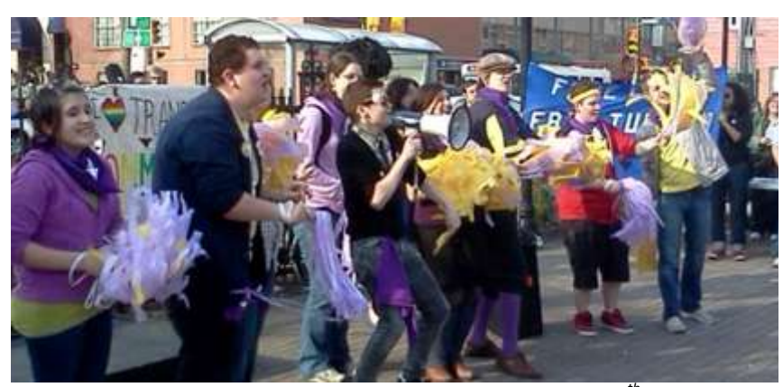
Youth Project Queerios cheer at the May 17<sup>th</sup> IDAHT rally.

This year we will continue to set the establishment of a community centre as a priority