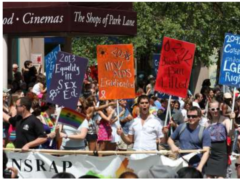
NSRAP in the Halifax Pride parade – health issues at the forefront.

In April 2011, NSRAP published an assessment of LGBTQ Health in Nova Scotia in Wayves Magazine. The health committee working group has prepared position statements regarding trans health in Nova Scotia and the LGBTQ blood bans. This formalization will help direct our advocacy efforts in the coming year. Still in its infancy and growing in numbers and engagements the Health