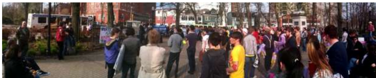
The crowd at the IDAHT rally in Victoria Park.