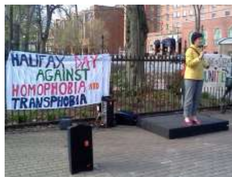
Halifax MP Megan Leslie shared a message of hope and encouraged effective strategizing in the fight for