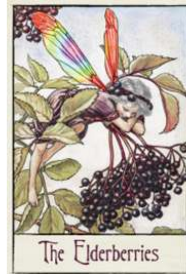
Logo for the Elderberries - LGBTQ Elders social group.