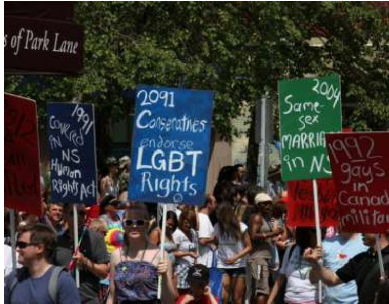
NSRAP in the Halifax Pride parade –history and future of change.

In addition to continuing our work related to LGBTQ elders and organizing our annual activities, NSRAP will continue to collaborate with members of the community and partner with other organizations in order to further our goals. This will hopefully include strengthening our relationship with Egale Canada and with government departments and officials as we continue to seek legal reform. In addition, fund development will remain an important aspect of our day-to-day work as our organization continues to grow and take on new and exciting challenges.