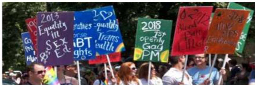
2010 Halifax Pride: NSRAP's vision for the future.

The second, Birth Registration Regulations—Suggestions for Change and Ongoing Issues , discusses the challenging situation that exists for a lesbian mother, who is not the birth mother, to become legally registered as the second parent. This document highlights the challenges for the non-birthing lesbian mother, proposes a solution to the language of the Vital Statistics Act and raises a number of ongoing issues to be considered by policy-makers. The work produced by the pro bono students raises a range of legislative issues that have a direct impact on many same-sex couples and families in Nova Scotia.