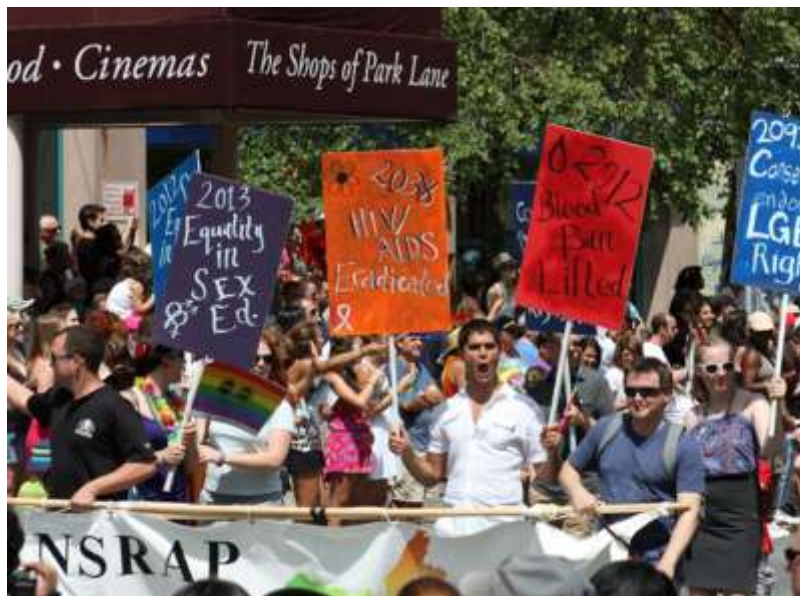
NSRAP in the Halifax Pride parade – health issues at the forefront.

In April 2011, NSRAP published an assessment of LGBTQ Health in Nova Scotia in Wayves Magazine . The health committee working group has prepared position statements regarding trans health in Nova Scotia and the LGBTQ blood bans. This formalization will help direct our advocacy efforts in the coming year. Still in its infancy and growing in numbers and engagements the Health Committee is encouraged by the progress in the 2010-2011 year and expects further progress in 2011-2012.