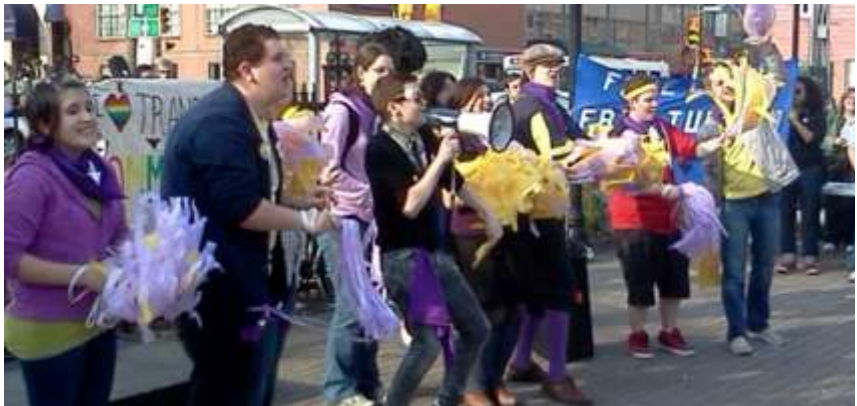
Youth Project Queerios cheer at the May 17 th IDAHT rally.

The board continues to meet on a bi-monthly basis with some exceptions to enable the various committees of NSRAP to work on their mandates. At present, this system functions well, particularly with a full complement of 15 NSRAP Directors. I anticipate that this organizational structure will continue through the coming year.