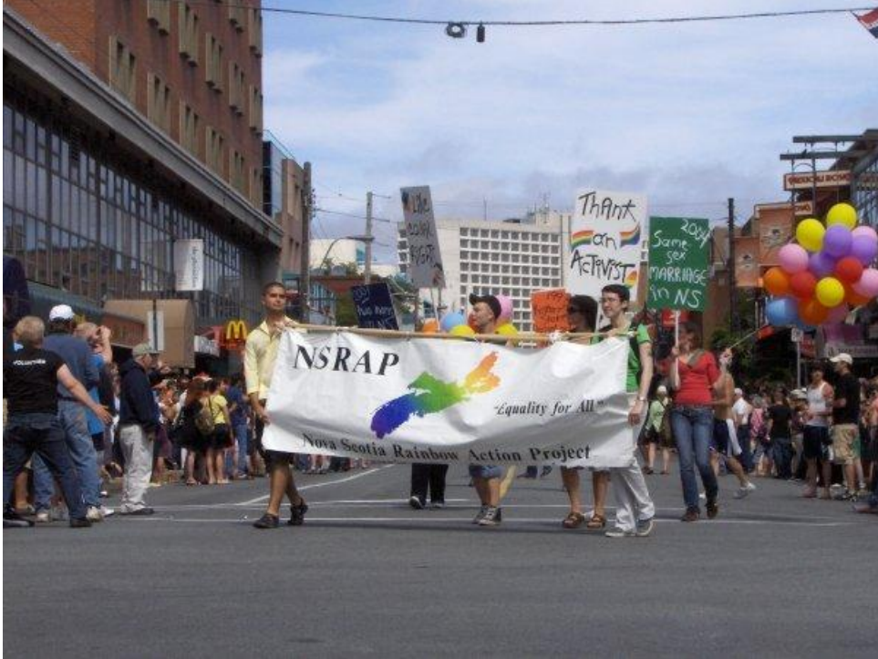
NSRAP marches during the Halifax Pride Parade, 2009